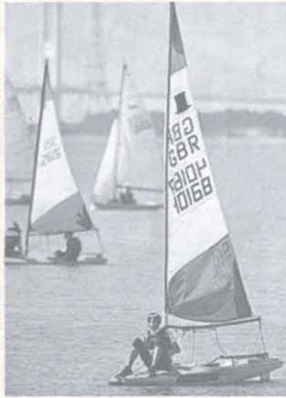
Right, Kendal's riverfront. Far right, the North Downs near Wye. Top right, one of Stamford's honey-coloured streets. Above, Thornbury Sailing Club's regatta on the Severn

Why we love it All the charm of the Cotswolds — without the snobs and tourists.